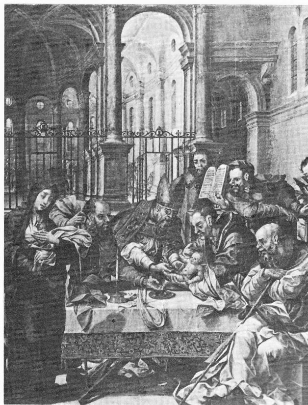
Fig 1. Circumcision performed by a bishop of the Church. Painted by Discepolo, Portuguese School, 16th century (courtesy of the Museum Nacional de Arte Antiga, Lisbon).

It is from the ancient Egyptians that the Jews derived the practice of circumcision. The ritual became such a crucial element of the Jewish religion that one can actually trace the biblical development of Judaism by the motif of circumcision alone. The practice was also a crucial issue in the development of the early Christian church.